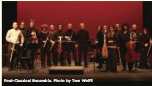
Post-Classical Ensemble.